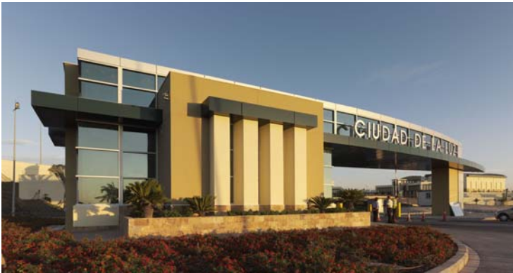
Main Entry Gate

Film and television production complex with production studio, backlot, film school, and water tank facility on the Mediterranean Sea. The studio contains 6 soundstages, production support, mill/shops, commissary, and administrative and executive offices.