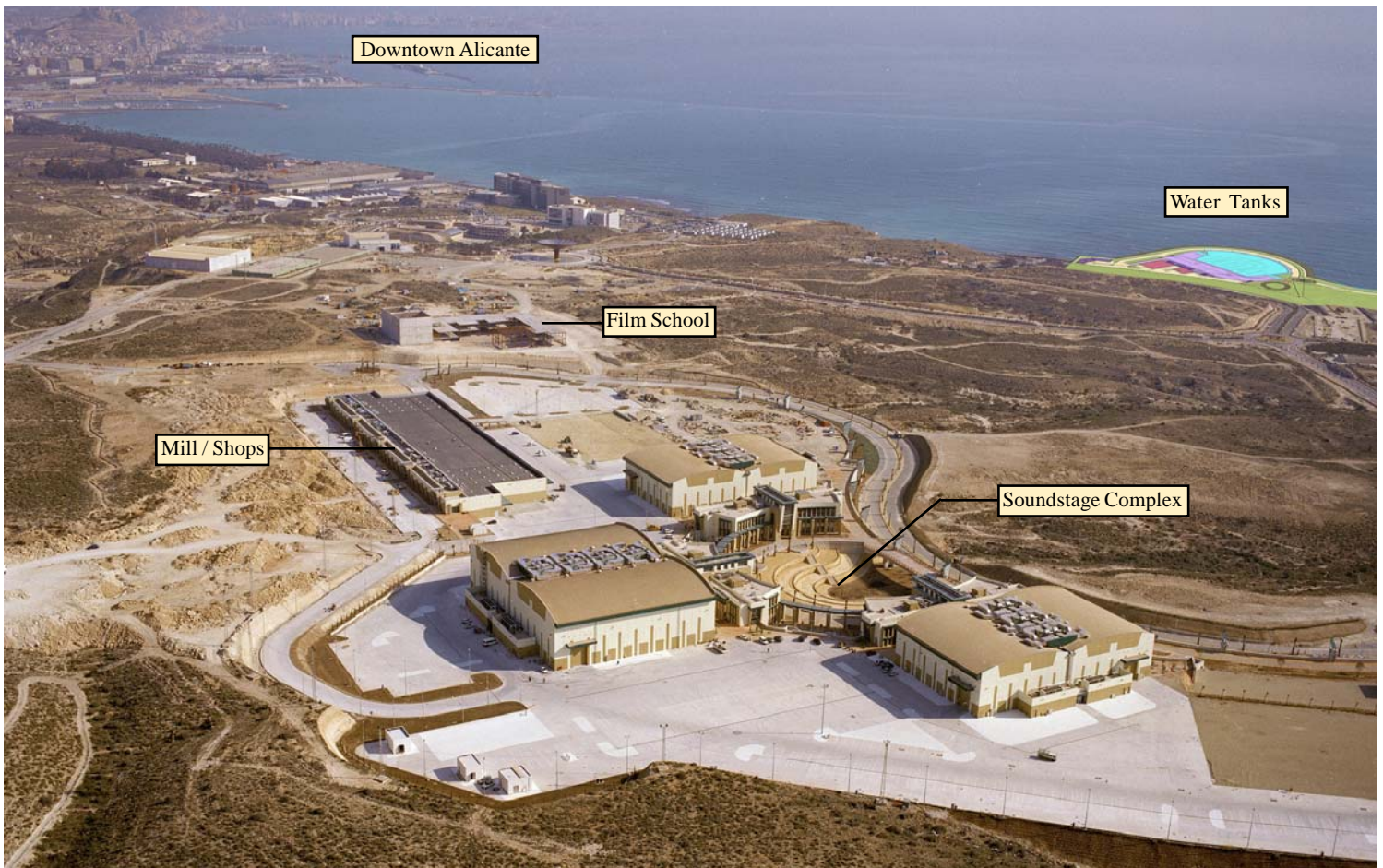
Aerial Photo with Mediterranean Sea Beyond